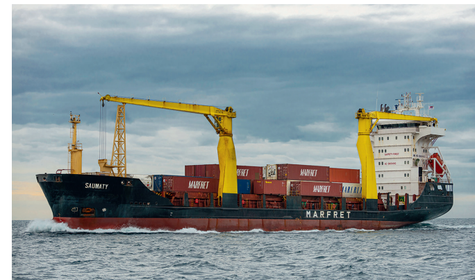
QINGSHAN Shipyard Hull N° KS960308 Delivery Dec. 2003